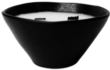
Product Name: 14 oz Luxe Candle Price: $50-$55 Wholesale: $32-$35