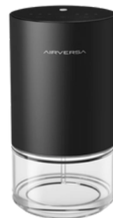
Product Name: Luxe Waterless Diffuser Price: $60-$70 Wholesale: $50-$60