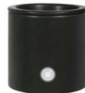
Product Name: Ceramic Wax Warmer Price: $22 Wholesale: $13