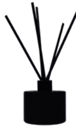
Product Name: 4 oz Luxury Reed Diffuser Price: $15-$20 Wholesale: $9.50-$12