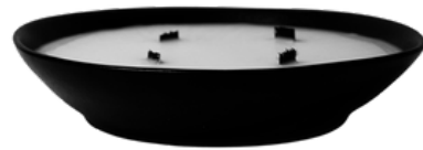
Product Name: 24 oz Luxe Candle Price: $75 Wholesale: $50