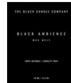
Product Name: 2.4 oz Luxury Wax Melts Price: $5-$7 Wholesale: $3-$4.20