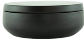
Product Name: 12 oz Luxury Candle Price: $27-$29 Wholesale: $15-$16.20