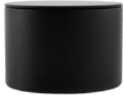
Product Name: 6 oz Luxury Candle Price: $15-$17 Wholesale: $9.50-$10.20